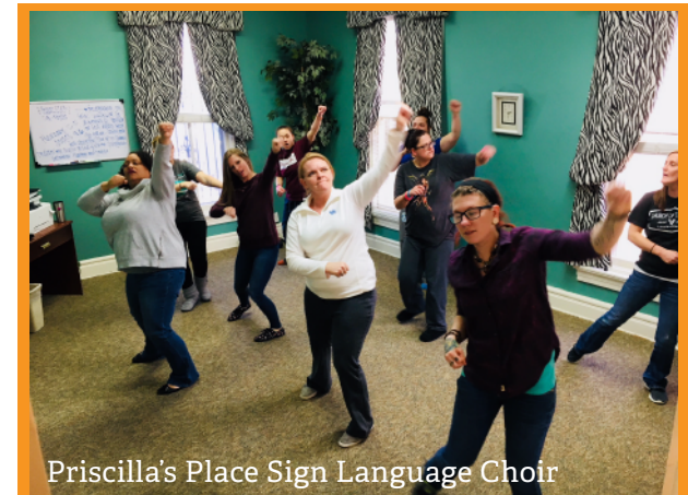
Priscilla's Place Sign Language Choir

While I was at Priscilla's Place I started to rebuild my relationship with my family. I was baptized and I grew in my faith each day. I graduated the 12-month program and went back to school. In the future I want to help minister to addicts that want to get out of their addiction. The verse that I reflect back on is Psalm 37:4, "Delight yourself in the Lord and he will give you the desires of your heart."